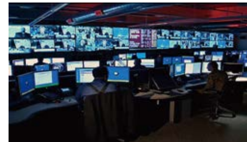
Police Command Center